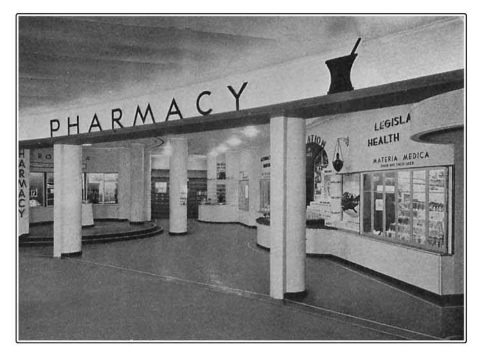
General view of the pharmaceutical exhibit as a whole. Note the difficulties encountered on account of the pillars.