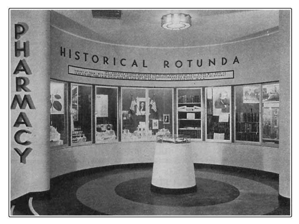
Detailed view of the Historical Rotunda. The inscription above is from Ecclesiasticus 38: 4, 6.