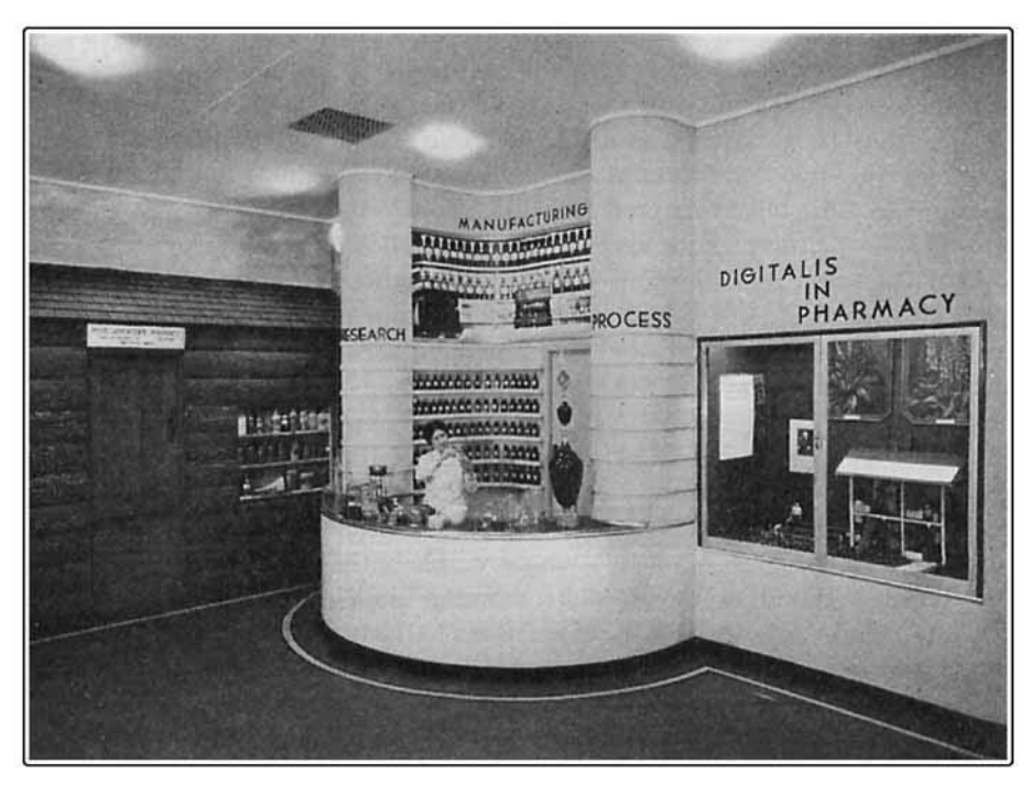
Detailed view of the first drug store in Chicago (Philo Carpenter). A modern pharmaceutical and chemical laboratory. Digitalis display.